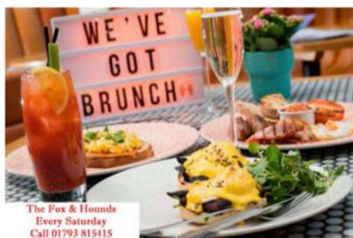
The Fox & Hounds Every Saturday Call 01793 815415

Slightly Spiced Tomato Sauce topped with Lashings of Mozzarella, Chicken Breast & Streaky Bacon & BBQ Sauce Sprinkled with our Blend of Italian Herbs